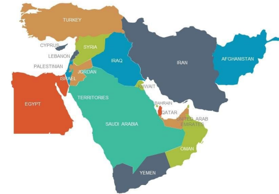
MIDDLE EAST Asia Map

All States can be colored and edited separately