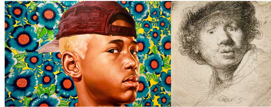
Kehinde Wiley – a famous Contemporary artist and diverse, cultural and celebrates youth culture in his amazing depictions of portraits

Portrait art captures the essence of a person through visual representation. This ancient art form spans cultures and time periods.