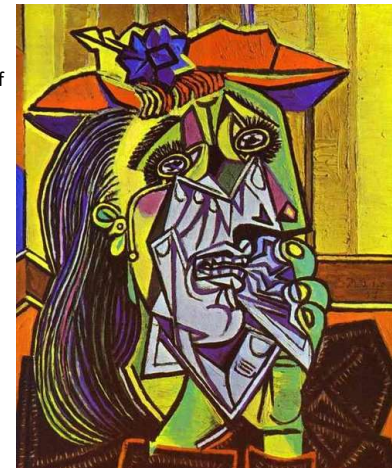
Picasso – self-portraits and famous for abstracting features and in particular this portrait of a Woman crying shows the impact on a sad event the passing of her husband.