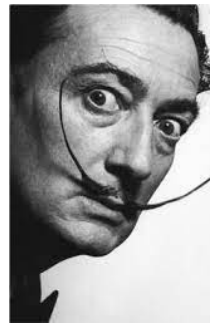
Salvador Dali Spanish painter B: 11 May 1904, D:23 January 1989. 'The Persistence of Memory' was completed in August 1931, and is one of the most famous Surrealist paintings